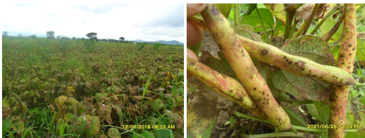
Fig. 2: Symptoms of anthracnose disease at the Tanzania Agricultural Research Institute (TARI), Selian

assigned genotypes from a large set of genotypes. The tool reduces bias and risk, by recording performance data across different growing seasons and locations (Etten et al. 2018, 2019). In addition, the tool allows sharing data through ClimMob software for meta-analysis to validate and improve recommendations based on existing data. Tricot has been used in different countries such as