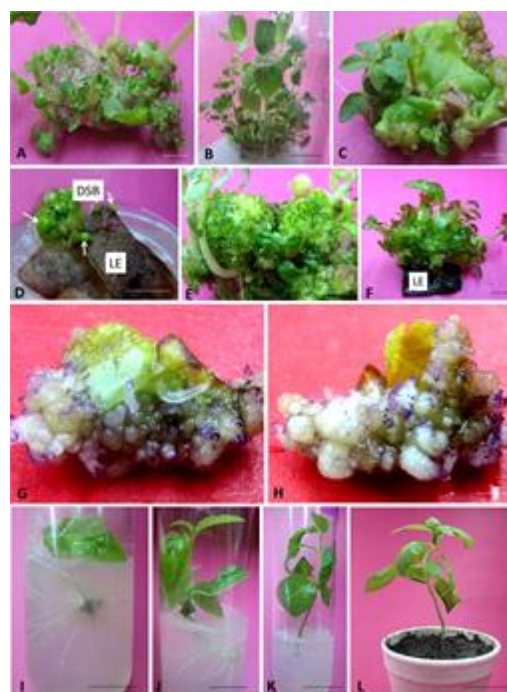
Fig. 2: Effect of different factors affecting on DSR from different explants of S. nigrum . A): Direct shoot regeneration from in vitro grown leaf explant on MS + 2.27 \mu M TDZ after 60 days of culture, Bar = 8 mm. B): Proliferation of the same regenerating shoots on liquid MS medium in glass jars, Bar = 22 mm. C): Shoot regeneration from cut margins from in vitro leaf explants on B_5 basal medium + 2.27 \mu M TDZ after 60 days of initial culture, Bar = 5 mm. D): Growth of DSR from field grown leaf explants on MS + 0.91 \mu M TDZ after 10 days of culture, Bar = 5 mm. E-F): Huge number of micro shoot buds on leaf explant on the same medium (MS + 0.91 \mu M TDZ) after 90 days of culture, Bar = 7 mm. G-H): 30-day old pigmented and fascinating shoot buds were observed at B_5 + 2.27 \mu M TDZ on field grown leaf explants, Bar = 5 mm. I-J-K): Rooting of regenerated shoots on half strength MS + 0.5, 1 or 2 \mu M IBA after 28 days of initial culture, Bars = 13, 15 or 20 mm, respectively. L): Acclimatization of plantlet in poly-cup filled with peat moss + garden soil + sand, Bar = 35 mm. LE = leaf explant; DSB = direct shoot bud