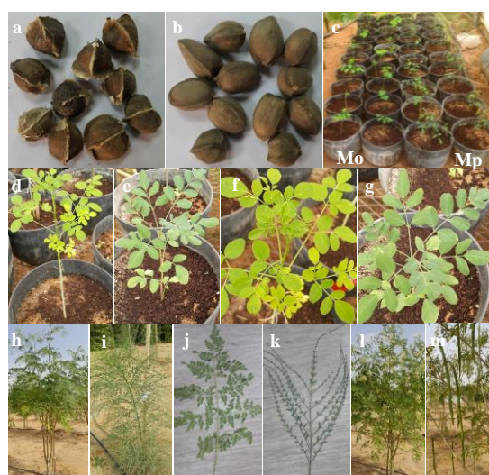
Fig. 1: Seed germination, seedling growth under greenhouse conditions, and plant growth under field conditions for M. oleifera (Mo) and M. peregrina (Mp). (a) Seeds of Mo, (b) Seeds of Mp, (c) Seed germination of both species two weeks after sowing, (d) Seedling of Mo, (e) Seedling of Mp, (f) Leaves of Mo seedling, (g) Leaves of Mp seedling, (h, j) Growth and leaf characteristics of Mo plants under field conditions, (i, k) Growth and leaf characteristics of Mp plants under field conditions, (l, m) Flowering and fruiting of Mo plant

G%, Germination percentage; MGT, Mean germination time; GR, Germination rate; GI, Germination index or speed; IP, Imbibition period for first (F) or last (L) germination. Means with similar letter at the same partition are not significantly different at \alpha = 0.05