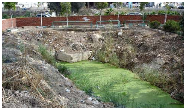
Fig. 1. Effluent sampling location

examination of water and wastewater (APHA, 1992). Field parameters (pH, conductivity & dissolved oxygen) were measured in situ using the multi-probe system (model Hydralab-Surveyor) and rechecked in laboratory using bench-top equipment to ensure data accuracy for biological parameters including total coliform count and fecal coliform count, phytoplankton identification and counting and chlorophyll a determination.