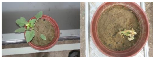
Fig. 6: Cocklebur before and after microwave application