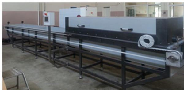
Fig. 1: A view of the prototype microwave oven in the laboratory