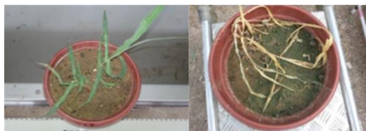
Fig. 4: Johnson Grass before and after microwave application