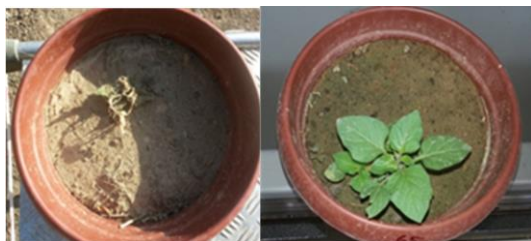
Fig. 3: Black nightshade before and after microwave application