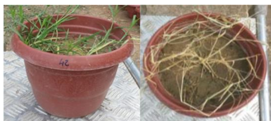
Fig. 5: Bermuda grass before and after microwave application