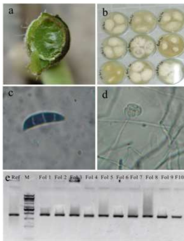
Fig. 1: Isolation and identification of Fol isolates. (a) Infected tomato stem showing vascular browning. (b) Culture purification of Fol isolates. (c) Macroconidia of Fol. (d) Microconidia production by Fol. (e) molecular identification of Fol by specie specific primer

Pathogenicity test of the different isolates for the isolated fungus was carried out under green-house conditions.