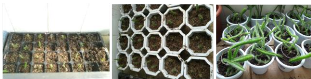
Fig. 5: Domesticating and transplanting of tissue-cultured red pitaya seedlings

In the present case, surface sterilization with 0.2% \text{HgCl}_2 (w/v) for 7 min can effectively reduce browning of red pitaya explants and increase their survival rate obviously. The optimal formulation of MS medium supplemented with 5.5 mg/L 6-BA and 0.10 mg/L NAA provided profuse and high percentage shoot regeneration in this study. The success of 6-BA in promoting efficient root induction has been reported for Ipomoea sepiaria Roxb, Cryptolepis sanguinolenta . (Monney et al. , 2016) and Caralluma bhupenderiana (Ugraiyah et al. , 2011; Cheruvathur et al. , 2015; Fatima et al. , 2015). In this study, addition of 6-BA along with auxin considerably increased morphogenetic response of red pitaya shoots as well as shoot number. Interestingly, the phytohormone combinations for the micropropagation of white pitaya ( Hylocereus undatus ) (Mohamed-Yasseen, 2002; Hua et al. , 2015) were distinctly different from our findings.