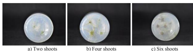
Fig. 4: Effects of different inoculation density on rooting of adventitious shoots