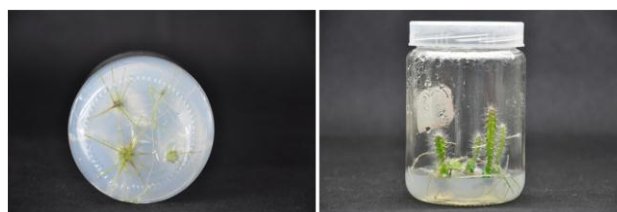
Fig. 3: Rooting of Adventitious shoots by optimal medium formulation

Influence of inoculation density on shoot rooting: The result showed that inoculation density of red pitaya shoots displayed a significant influence on its rooting rate, and revealed that rooting rate increased at first and then decreased gradually along with the increasing number of adventitious shoots (Table 4). The rooting rate of treatment 2 (4 inoculated shoots) was the highest (71%), and the roots were stronger and structurally uniform, this would provide better effect to improve posterior transplanting survival rate of tissue-cultured seedlings. Total number of roots was 91 in 1/2MS medium inoculated 6 red pitaya shoots, while the browning percentage of shoots significantly increased to 23%, which resulted in difficult posterior transplanting.