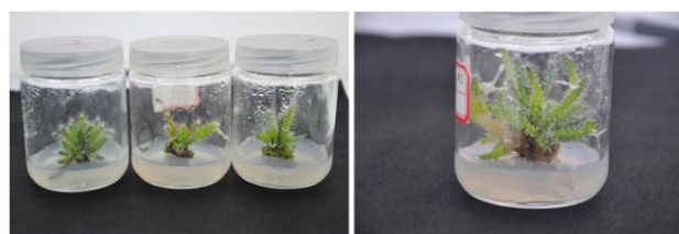
Fig. 2: High-efficient proliferation of red pitaya adventitious shoots

(a) Sterilized explants; (b) Swelling of dormant buds; (c) Growing of adventitious shoots