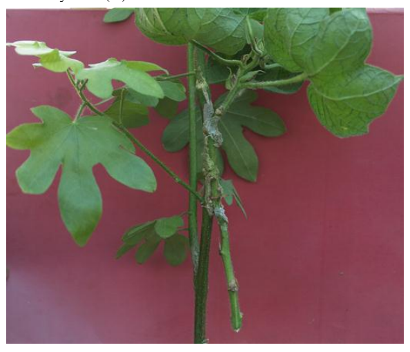
Fig. 1: Picture showing union of the grafted root stock of G. arboreum genotype Ravi and scion of the symptomatic susceptible G. hirsutum genotype CIM-496

Disease transmission was 100% on all the successfully grafted plants of G. arboreum (Ravi) and G. hirsutum (CIM-496) in the present case. Positive amplification was seen in all the samples both for CLCuBuV and CLCuMB<sup>Bur</sup> through PCR. As expected G. hirsutum genotype CIM-496 was the first to develop disease symptoms 10 days after graft-inoculation and showed sever symptom within 20-25 days post inoculation with no reduction in disease severity till the end of the experiment. Conversely, all the graft inoculated plants of G. arboreum (Ravi) unexpectedly initiated disease symptoms 25 days after graft-inoculation as slight vein swelling/darkening and enations on 3-10% leaves. These findings are in contradict with those of Rahman et al. (2002, 2005) who found that G. arboreum cannot be infected with CLCuD and cannot develop symptoms even under heavy loads of virus through grafting. Akhtar et al. (2010) also observed the latent infection in case of G. arboreum (Ravi), as they did not find any visible symptoms after graft-inoculation with CLCuBuV, but found