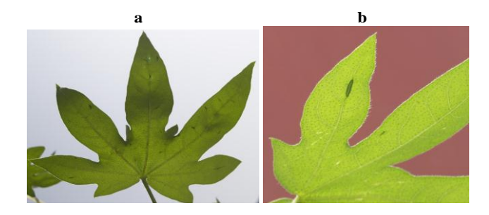
Fig. 4: (a) Gossypium arboreum showing minor vein swelling and darkening and (b) G. arboreum showing vein enation

glasshouse. We hypothesized that this may be one of the reasons of contradictory results. Because environmental factors such as temperature is found to have great influence on plant virus interactions (Szittya et al. , 2003; Chellappan et al. , 2005; Tuttle et al. , 2008; Ogwok et al. , 2010). However, there is no obvious expiation for this and it needs further probe.