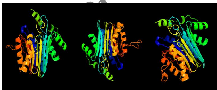
Fig. 1: 3D structure of asparaginase protein in N. crassa (Left), SFS (Center) and NFS (Right) of S. fomicola

Image coloured by rainbow N → C terminus