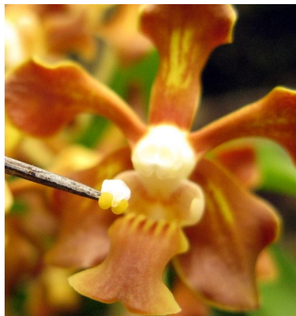
Fig. 3: Orchid cap-pollen mass-corona The pollen block adhered to the tweezers on one end of the core beak

The cystic lips and the pollination channel are features of the genus Cylindropuntia that serve as a “trap” for the pollinators (Dressler, 1993; Cribb, 1998). Through the distinct morphology of the labial and sepals, orchid flowers can be divided into two categories: the curtilage type and the orchid type. Wild type flowers (such as hard leaf pocket orchid P. micranthum t. Tang et f. t. Wang, apricot yellow pocket P. armeniacum s. c. Chen, et f. y. Liu) are similar to most wild flowers, where the sepals are usually small, where their lip for margins are curled inward spherical or near spherical capsule. This type of flower is mainly pollinated by bees (Liu et al., 2005; Shi and Cheng, 2007). Pocket orchid flowers, such as the purple hair pocket orchid P. villosum (Lindl.) Stein, and ribbon pocket P. parishii (Rchb. F.) Stein, long flap pocket P. dianthum t. Tang et f. t. Wang, have sepals that are usually larger, lip to edge upright helmet capsule. The pocket orchid flowers are usually