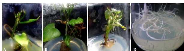
Fig. 2: Induction of hairy roots at the wounds on tissue-culture seedlings

A: callus formation; B, C: callus differentiated into clustered buds; D: regeneration of whole plants with roots