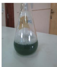
a. Pseudomonas spp