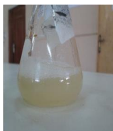
b. Bacillus spp